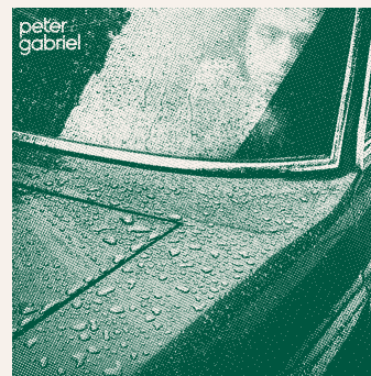
PETER GABRIEL PETER GABRIEL (CAR) (1977)

A reimagined daiquiri with white rum, citrus, sugar, and a touch of cointreau. Served under a mint and lemon cloud that rains into the glass, shifting the drink from a crisp daiquiri to a refreshing mojito-like twist.