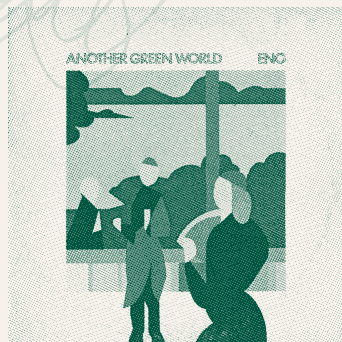
BRIAN ENO ANOTHER GREEN WORLD (1975)

A smooth, velvety variation blending the flavors of an espresso martini with a touch of nutty warmth. Garnished with three coffee oil drops in the glass.