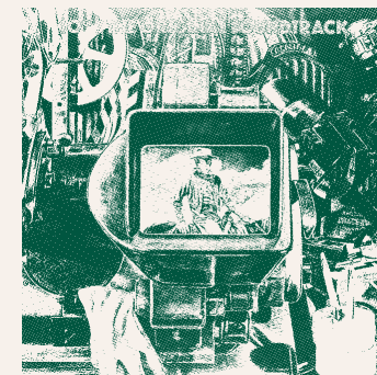
IOCC THE ORIGINAL SOUNDTRACK (1975)

A botanical twist on the old fashioned, with bourbon infused with thyme and rose, sweetened by a croissant syrup. Served in a smoked decanter for added depth and dramatic effect.