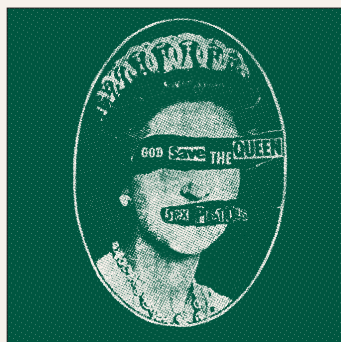
THE SEX PISTOLS GOD SAVE THE QUEEN (1977)

A bold, spicy take on a spicy margarita, infused with tropical sweetness and a smooth finish. Topped with a crown-shaped mango and white chocolate garnish, it's a bold tribute to the rebellious spirit of the album.