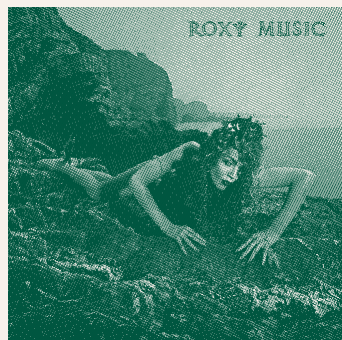
SIREN - ROXY MUSIC (1975)

A herbal twist on the classic gimlet, subtly sweet, served in a jellyfish-shaped glass. Topped with a citrus-scented aromatic bubble, giving the mesmerising allure of medusa.