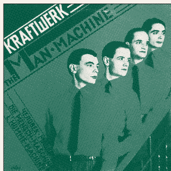
THE MAN MACHINE - KRAFTWERK (1978)

A smoky, herbal riff on the negroni. Garnished with a spherification of red wine and grapefruit juice, to be eaten before drinking, preparing the palate for the cocktail.